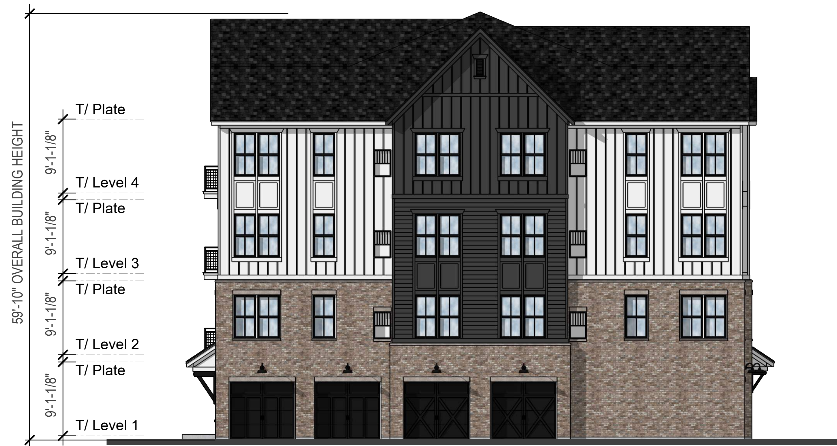
Typical Left Elevation Scale: 1/8" = 1'-0"